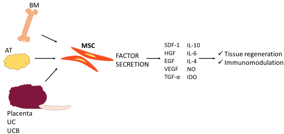
Fig. 1. MSC sources and secretome. MSC can be isolated from a variety of tissues, such as bone marrow, adipose tissue, placenta, umbilical cord, umbilical cord blood, liver, dental and more. MSC can transdifferentiate in vitro to other tissues but it is assumed that most of the benefits come from the factors they secrete in the target environment.

thyroiditis, there was migration and nesting of intercellular adhesion molecule (ICAM)-overexpressing mMSCs towards the inflamed thyroid (Ma et al. , 2017).